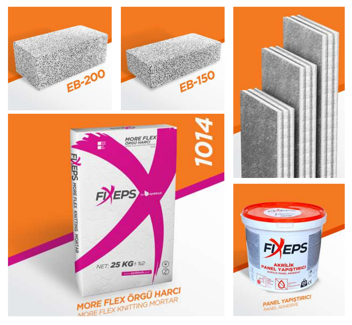
Epsblocks, Wall Panels, Insulation Blocks, Construction Chemicals

As the EPSBLOCK family, we aimed to offer people more comfortable living spaces on the path we set out on in 2011. We wanted to show them that the comfort they dream of is not impossible. As a result of our R&D studies, market research, and product trials, we have achieved our goals with sure steps. By eliminating the use of different materials and different application requirements for each problem, we have solved many problems with a single product.